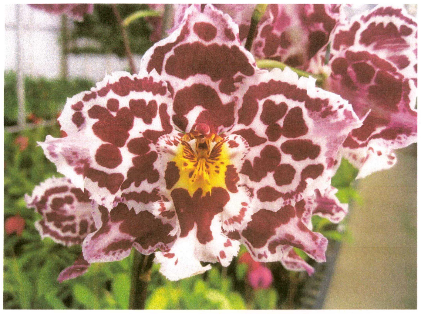
Odm Stropheon 'Pacificia FCC/AOS 1960