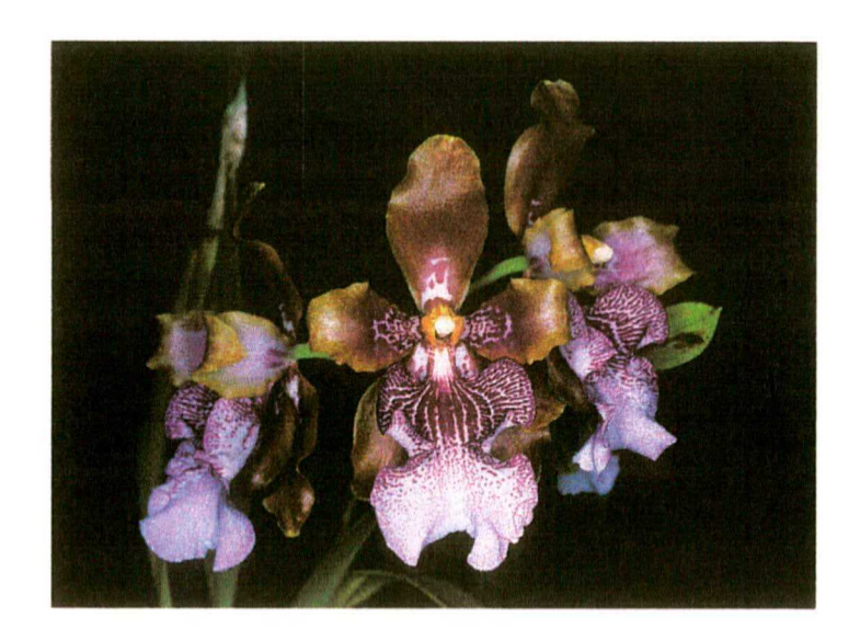
Figure 10 Odontoglossum wyattianum regular form, Peru