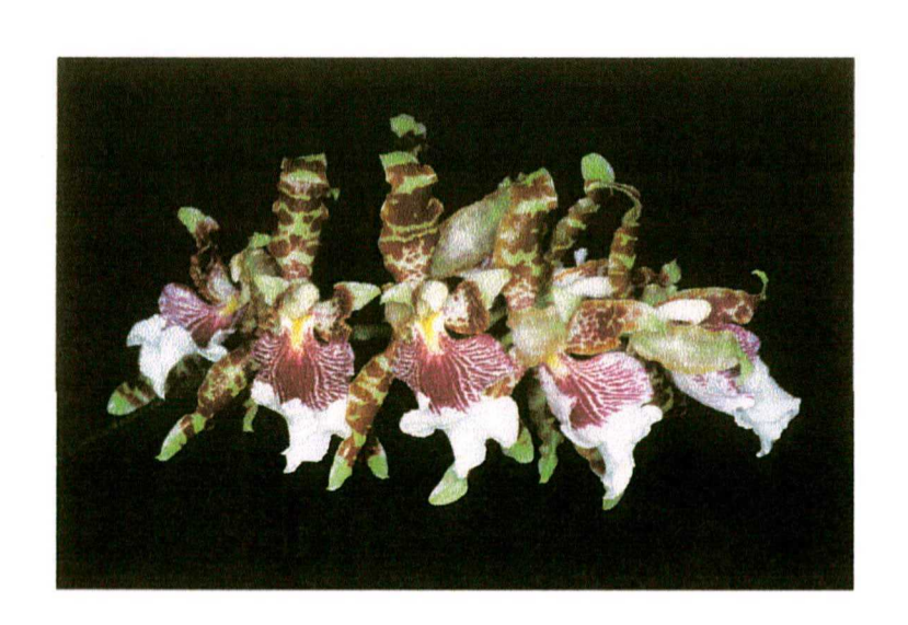
Figure 5 Odontoglossum harryanum light colored form from Ecuador