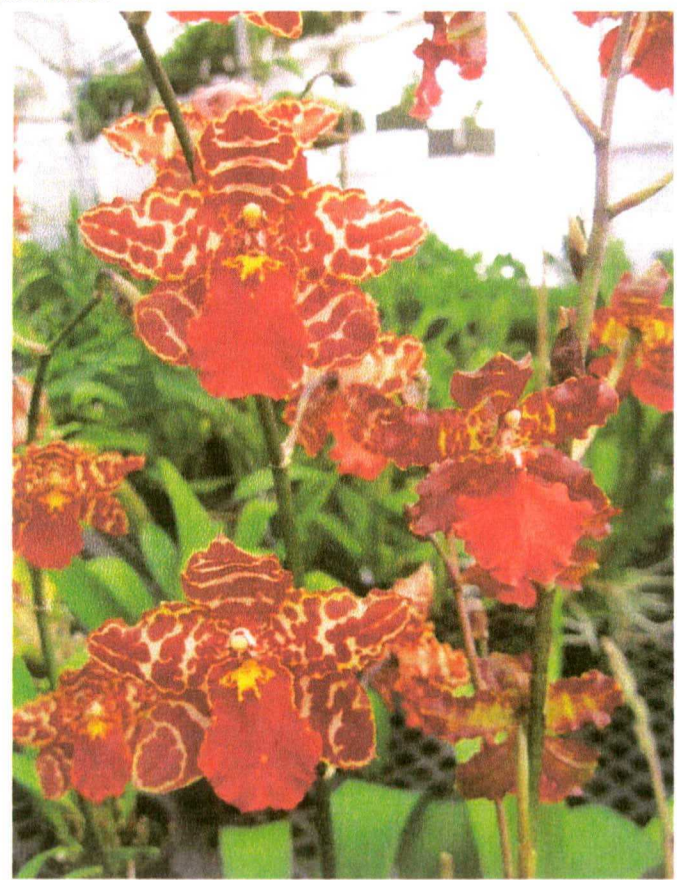
Odm Summit x Oda Crystal Palace

This seedling of Odm Summit X Oda Crystal Palace was hybridized at The Orchid Zone. I have no way of knowing whether their Summit parent was diploid or tetraploid but I am certain the plant of Summit in the comparison shot is diploid. The hybrid has been very showy and I have one that will carry a 4 foot+ spike with several strong branches as well. It tends to not open all the flowers at once but they last for many weeks. I have tried, unsuccessfully, to make pods on it so maybe the plant is indeed triploid. In my opinion it is solid AM quality but then that might require knowledgeable judges to recognize its uniqueness!