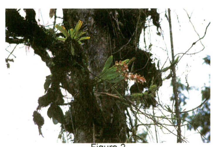
Figure 2 Odontoglossum harryanum Ecuador