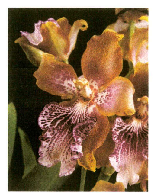
Figure 9 Odontoglossum wyattianum Peru, paleform