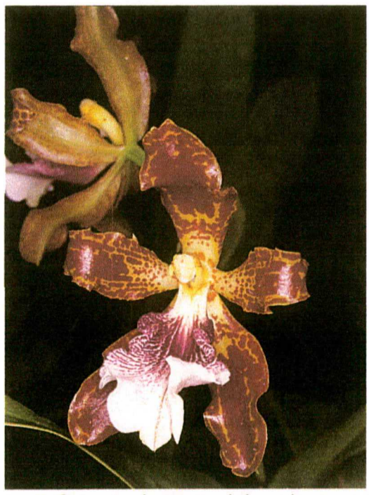
Figure 6 Odontoglossum deburghgraveanum Ecuagenera