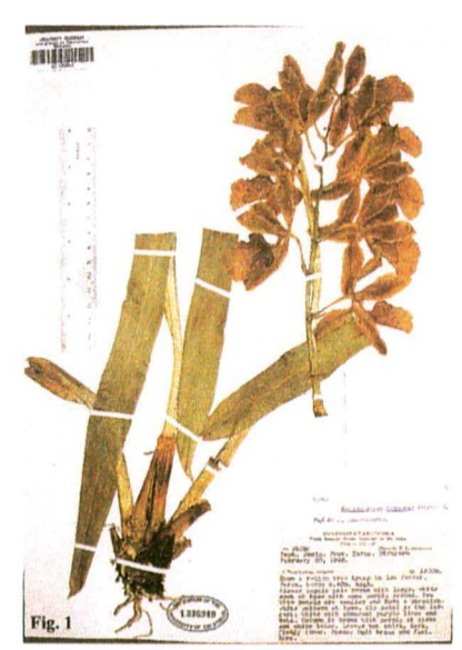
Figure 13 Odontoglossum wyattianum Type specimen