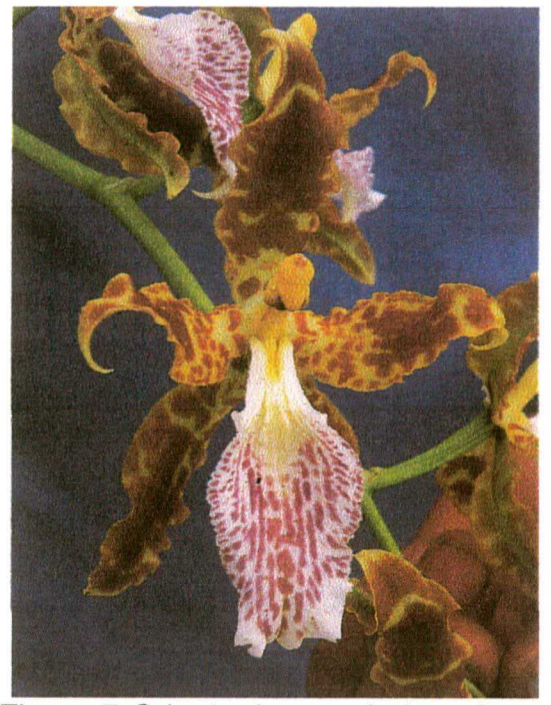
Figure 7 Odontoglossum helgae Peru