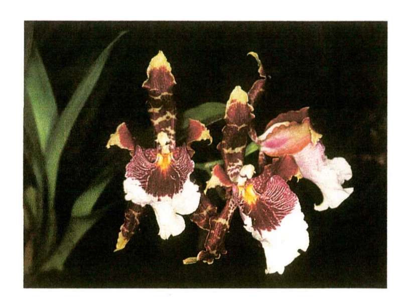
Figure 4 Odontoglossum harryanum, open flower from Ecuador