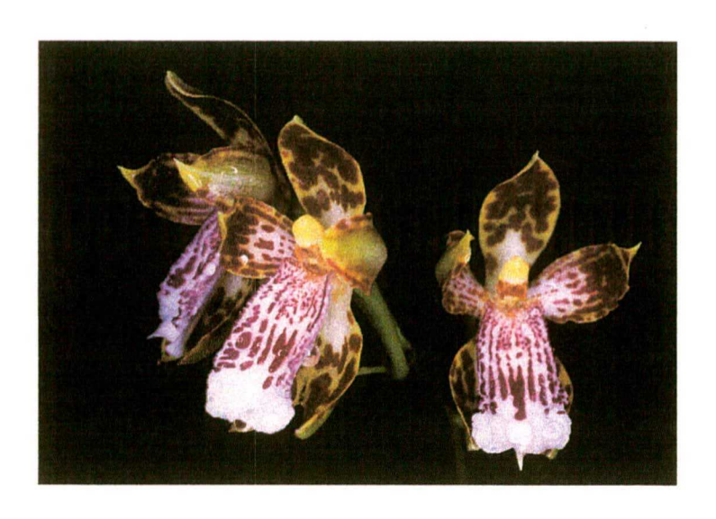
Figure 8 Odontoglossum vellum Ecuador