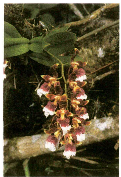
Figure 3 Odontoglossum harryanum Ecuador plpant in cut tree