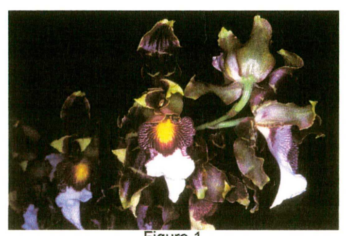
Figure 1 Odontoglossum harryanum Colombia