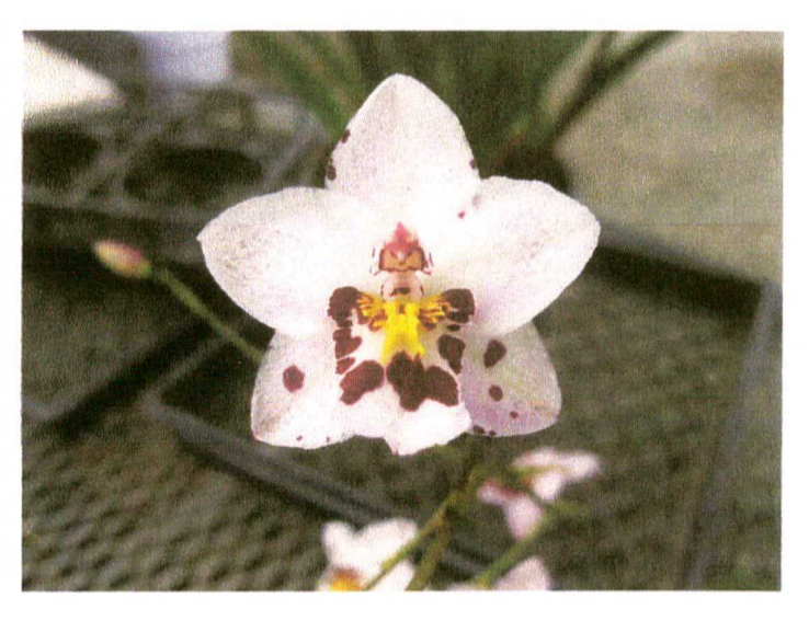
Cyrt edwardii x Odm Nicky Strauss