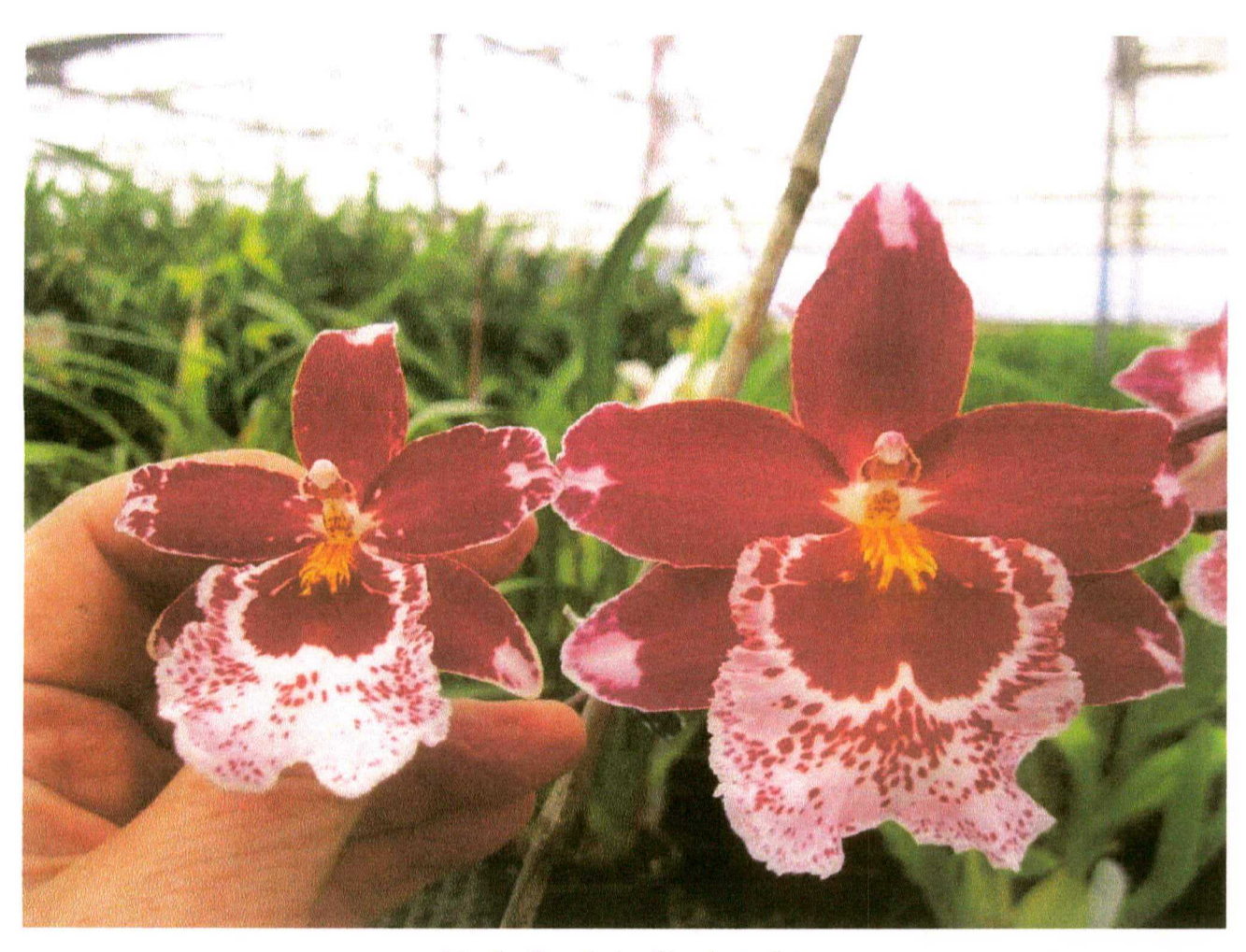
Vuyls Cambria Plush 2n&4n